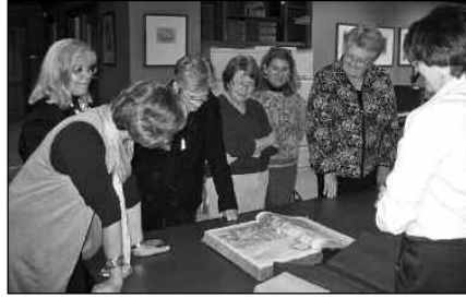
Gari Melchers Home and Studio tour group